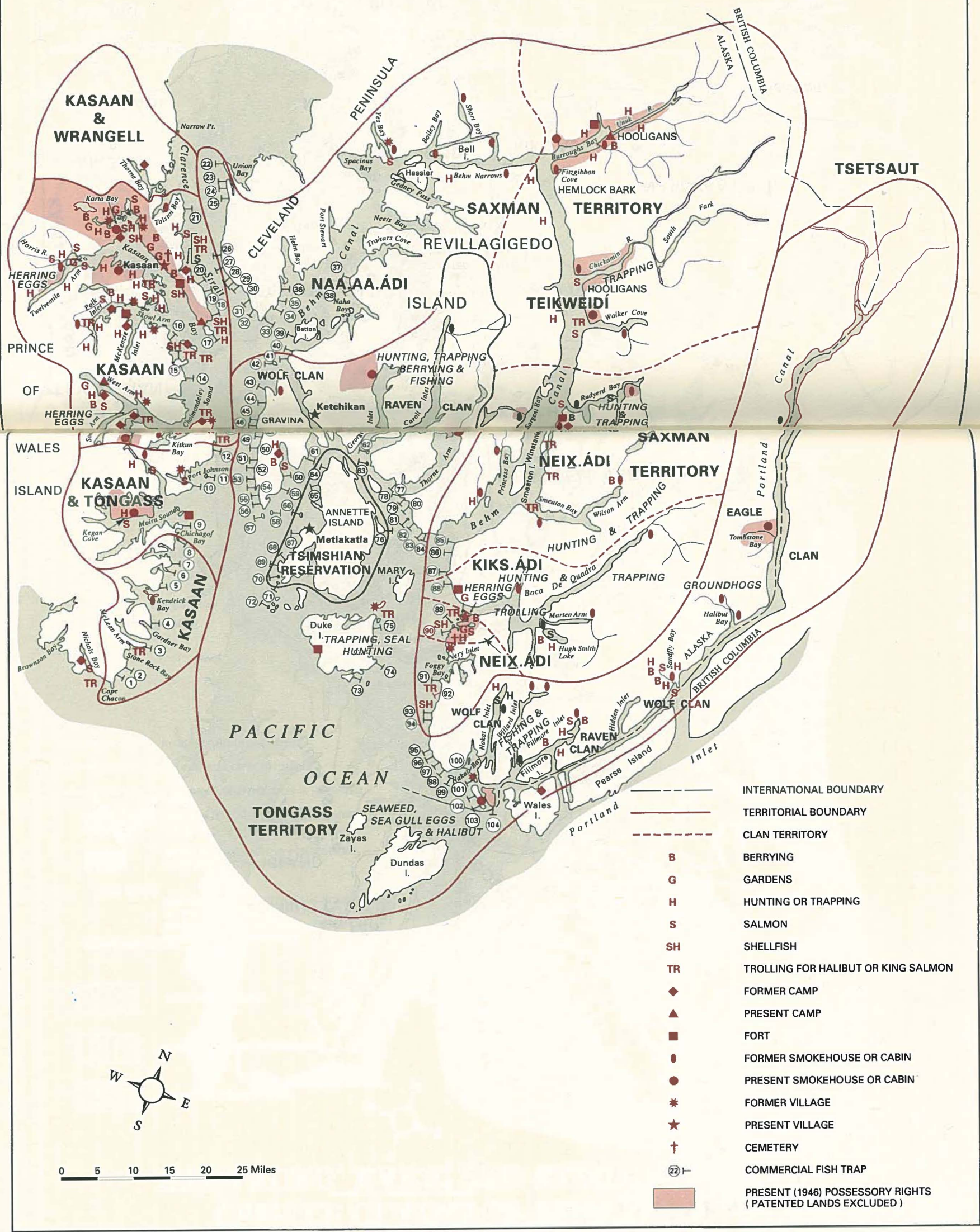
Chart 12: SAXMAN, KETCHIKAN, AND KASAAN TERRITORY SHOWING ABORIGINAL USE AND OWNERSHIP AND PRESENT (1946) USES