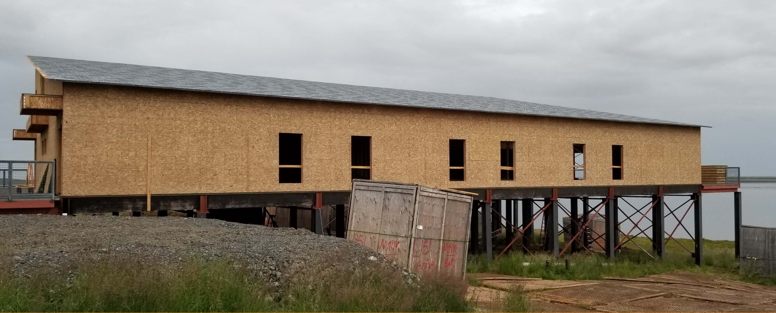
Mertarvik Evacuation Center